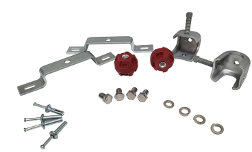
Universal Buss Bar Installation Hardware Kit, UL467 Compliant