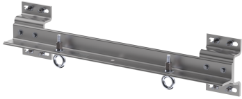
Cable Support Mount for Guyed Towers to Support Cable, 36" Face

-The "860674607-036 is a purpose built tower face bracket that is designed to support 1000 pounds of cable per eye up to 2000 pounds in combination. Ideal for Hybrid cable. Includes mounting eye bolt for attachment.