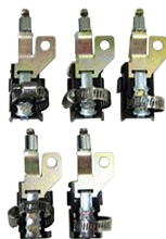
Mini-OTE 300-Series, Optical Terminal Pole Cable Retention Kit