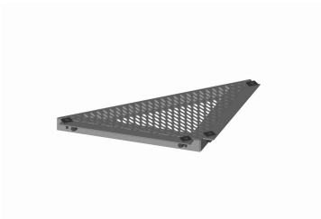
Waveguide Bridge Corner Filler, 90°