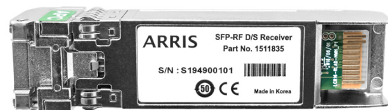
Downstream Analog Receiver

The SFPs operate in conjunction with a plug-in filter which is installed in the RPD. The filter prevents noise ingress from non-overlay RF signals from interfering with RF overlay signals. Plug-in filters are available in 550 MHz and 750 MHz options to support common analog broadcast signals.