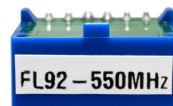
Plug-in Filter (550 MHz shown)