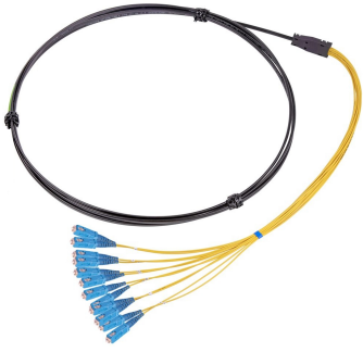
Fiber Optic Cable Assembly, 12 SC/UPC to Stub, 12-fiber, 1000 Feet