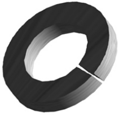
Galvanized Lock Washer, 3/8 in