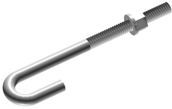
J-bolt Kit, 8 in