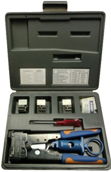
Modular Plug Pro-Installer Hand Tool Kit, 8-position, 6-position dies