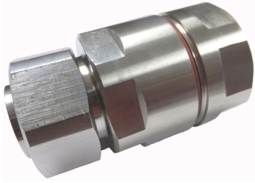
7-16 DIN Male Low PIM Positive Stop™ for 7/8 in RCT RADIAX® Radiating cable