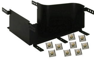
FiberGuide® Left Reducer, 4x12 to 4x6in, Black