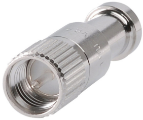
Mini UHF Male for 1/4 in FSJ1-50A cable