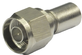
Type N Male for CNT-400 braided cable