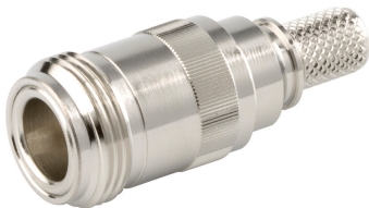
Type N Female for CNT-300 braided cable