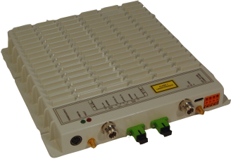
ION®-B Series Medium Power Remote Unit for GSM 1800 and UMTS