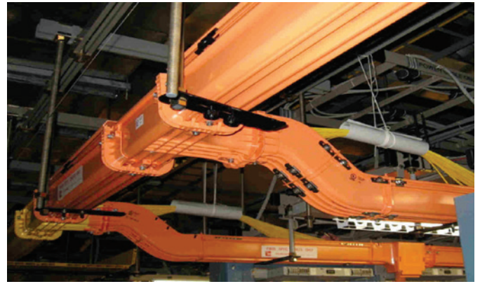
Figure 1: Fiber paper retrofit technique shown

Assessing your current fiber counts and planning for future fiber growth is the first step in creating your future-proofed network infrastructure.