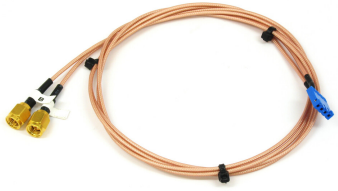
TMA Power Cable, dual SMA male to receive multicoupler, 0.8 m