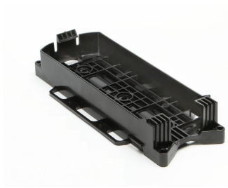
DLX® Mini-MST, Fiber Optic Universal Mounting Bracket