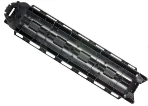
DLX® MST, Fiber Optic Universal Mounting Bracket, 12 port