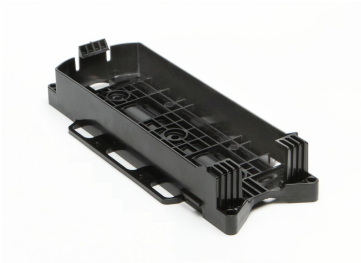
DLX® Mini-MST, Fiber Optic Universal Mounting Bracket