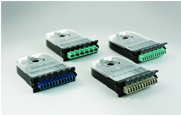
G2 Modular Cassette with 6 ST OptiSPEED® Multimode Pigtails, Type A