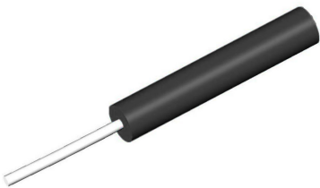
LazrSPEED® 900µm Tight Buffered Fiber